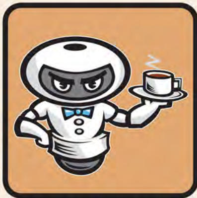
Joe's Special Blend

In addition to Espresso level benefits, your company name will also appear on team t-shirts and on the banner displayed at tournaments, robot demos, and public events. You will also be presented with a Cappy plush mascot for your support!