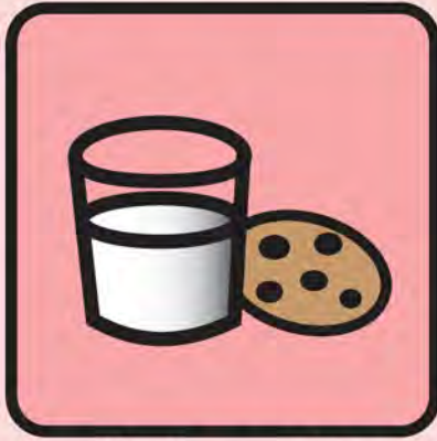
milk & cookies